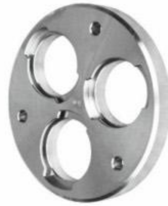
非标法兰 Non-standard Flange