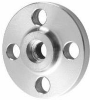
承插焊法兰 Socket Welding Flange