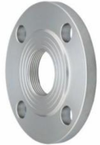
螺纹法兰 Threaded Flange