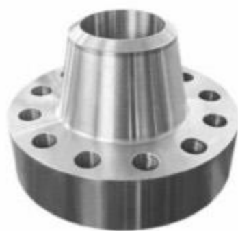
高压对焊法兰 High Pressure Butt Welding Flange