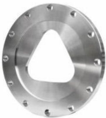
非标法兰 Non-standard Flange