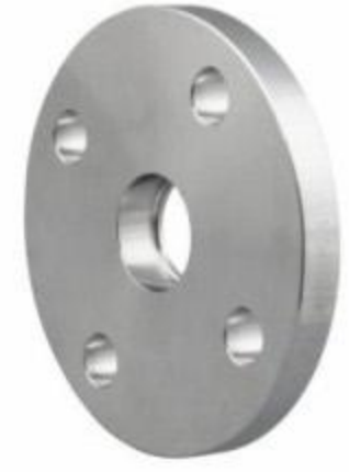
非标法兰 Non-standard Flange