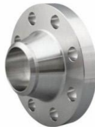
对焊法兰 Butt Welding Flange