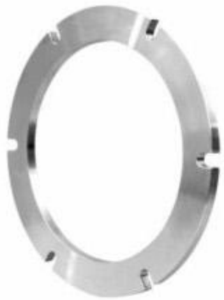
非标法兰 Non-standard Flange