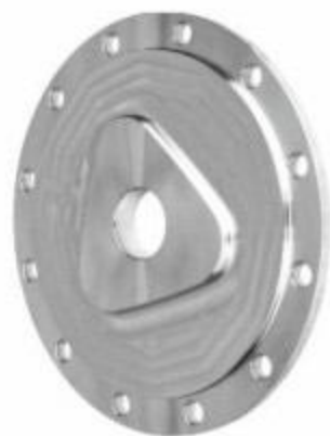
非标法兰 Non-standard Flange