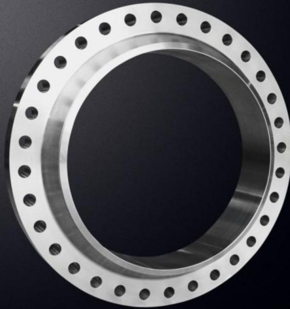
大口径对焊法兰 Large Diameter Butt Welding Flange