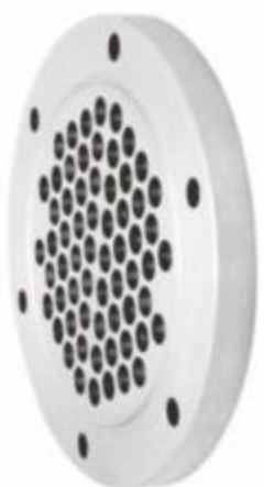
管板 Tube Sheet