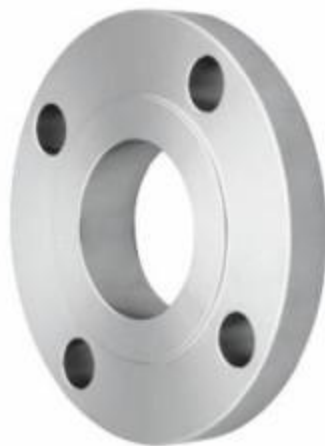
平焊法兰 Flat Welding Flange