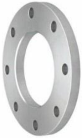
松套法兰 Loose Flange