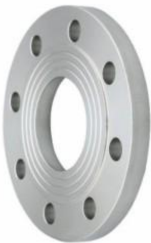
平焊法兰 Flat Welding Flange