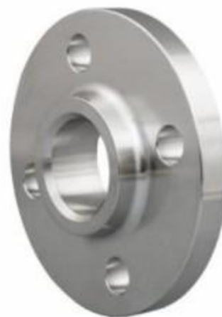
带颈平焊法兰 Welding Neck Flange