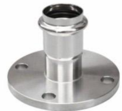
卡压法兰 Compression Flange