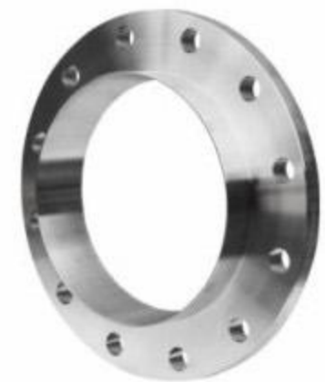
非标对焊法兰 Non-standard Butt Welding Flange