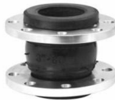
软接头法兰 Soft Joint Flange