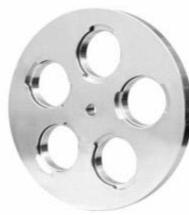
非标法兰 Non-standard Flange