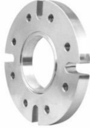
非标法兰 Non-standard Flange